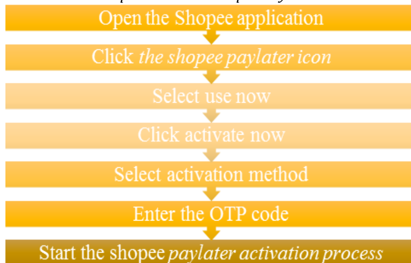
Figure 1. Steps to Activate Shopee Pay later

Once the Shopee Paylater feature is active, users can use Shopee Paylater as a payment method for shopping transactions. The way to use Shopee PayLater at checkout is: