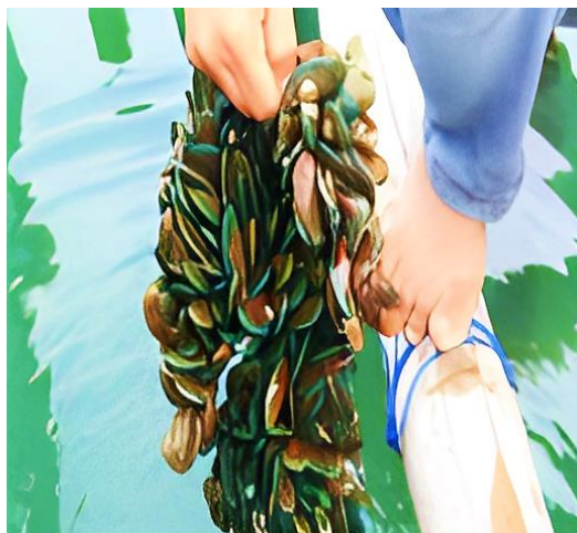
Figure 1. Green Mussels ( Perna viridis )

Green mussels ( Perna viridis ) are a group of soft-bodied animals (mollusks) that have two paired shells (bivalves) and are green in color. Green mussels ( Perna viridis ) live in muddy sand substrate habitats in estuary waters, as well as mangrove areas. Generally, they live sessile, attached and clustered at the bottom of hard substrates, such as coral rocks, wood, bamboo or hard mud (Katon et al., 2020). Green mussels are mollusca that have the ability to absorb small particles around or called filter feeders. Due to their filter-feeding nature, green mussels are employed as bioindicator of environmental pollution and as experimental subjects for testing the presence of heavy metals in the ocean (Chaerunnisa & Supardi, 2021).