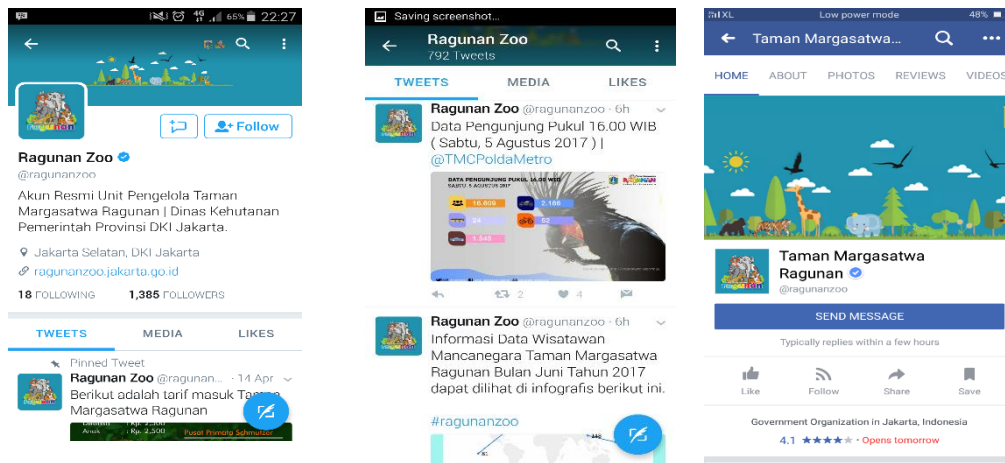
FIGURE 2. Twitter dan Facebook Ragunan Zoo

Apart from Facebook and Twitter, Ragunan Zoo currently also has an Instagram social page. This intends to facilitate the connoisseurs of photography because various photos are posted. The majority of the photos displayed on the Instagram page are photos of animals in this animal park. Not only relies on photos, public relations practitioners also provide education that is an explanation of the animals contained in the photo. Activities carried out by managers are also made public once in a while. This intends to foster a good image about the manager Ragunan Zoo.