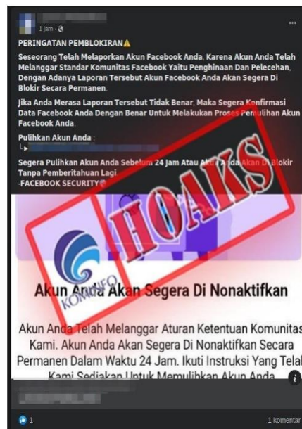
Picture 6 Hoax News in the Media

Hoax violations occur on platforms like Facebook in the form of chain messages, such as warnings about account blocking and instructions on how to avoid it. These messages claim that the recipient's account will be immediately blocked and instruct users to follow a link to enter their email and Facebook account password to prevent the block. Upon investigation, it was found that these chain messages about account blocking are false and constitute hoax information; the messages do not come from any official Facebook source. Such hoax chain messages can lead to user data breaches, which may result in serious consequences and harm the parties involved.