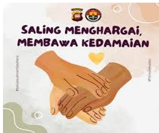
Picture 4 Symbol of Sustainable Communication Relationships

The role of communication in building polite, respectful, and considerate relationships lies in understanding the key principles required to maintain good and long-term interpersonal connections: