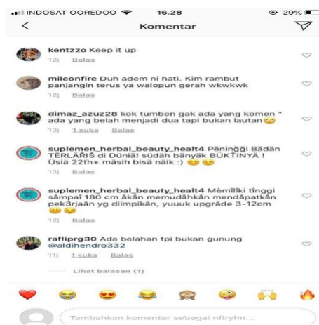
Picture 5 Forms of Ethical Violations in Digital Media Communication

The image above illustrates violations of language ethics in social-media advertising. Today, consumer demand for products is heavily influenced by advertising, which means that media users are continuously exposed to advertisements. Each of us has the potential to become an advertiser; however, a common mistake found in practice is the excessive use of language that does not correspond to the actual product. This constitutes an ethical violation in the form of dishonesty, leading consumers to make