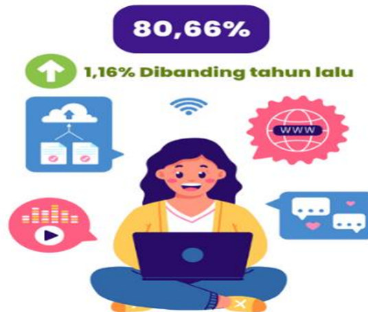
Picture 1 APJII 2025 Internet data penetration Tingkat Penetrasi Internet di Indonesia Tahun 2025