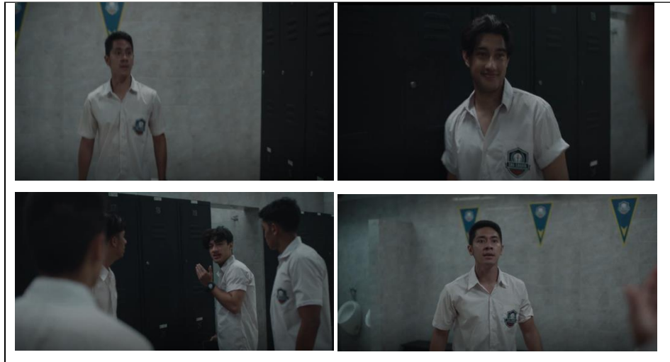
Analysis Table representation Figure 5