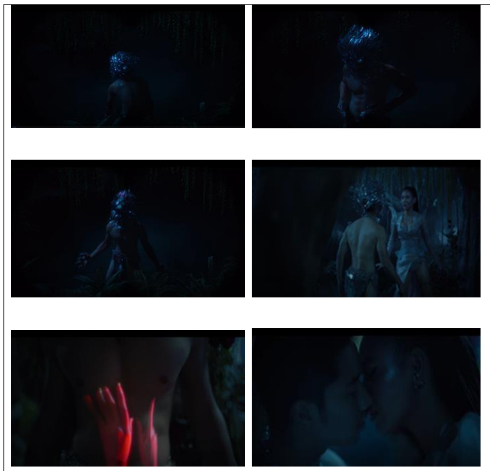
Figure 1. Scene in the Bush Forest ( minutes 01:03 – 03-02)