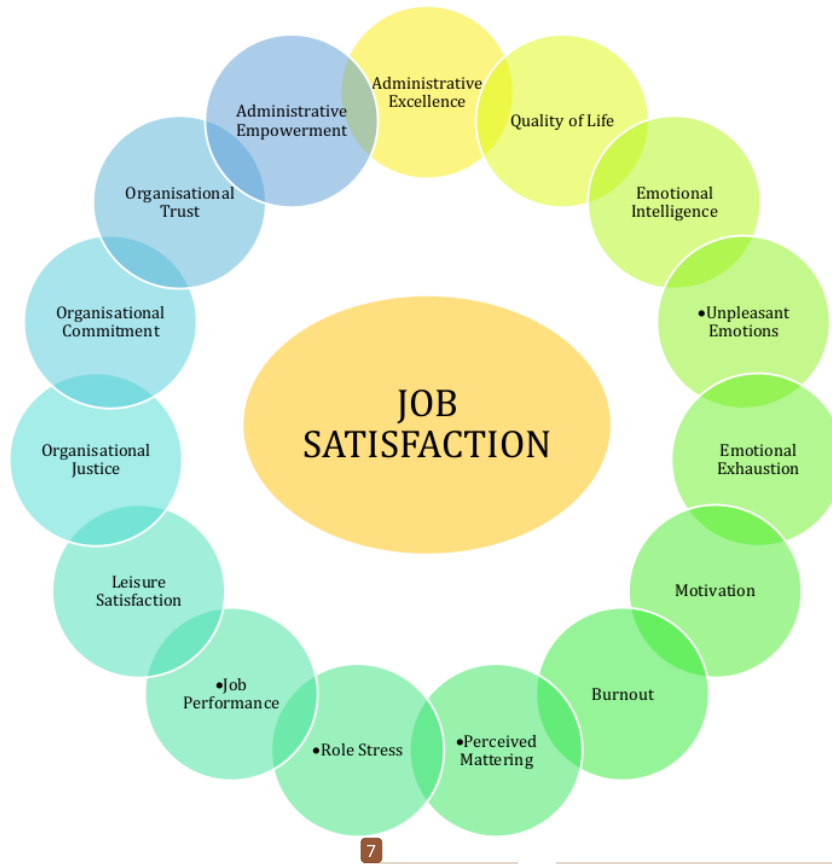
Figure 3. Variables that Contribute to Job Satisfaction for Physical Education Teachers

The goal of this study was to conduct a comprehensive analysis of job satisfaction levels among physical education teachers using a systematic assessment of the available literature. The results of this study reveal some important findings in the context of physical education teacher job satisfaction. Only 13 countries participated in this study, with Turkey, the United States, and Greece dominating. Furthermore, the majority of physical education teachers express high levels of job satisfaction (Altahayneh et al., 2014; Sultan & Gatea, 2023; Vousiopoulos et al., 2019), although there are disparities in satisfaction levels among them. It is relatively low, as is the case among physical education teachers in Slovakia (Balga & Antala, 2022) and Poland (Rutkowska & Zalech, 2015). Physical education teachers' job satisfaction can vary based on factors such as school size, job security, interactions with students and colleagues, working conditions, salary, and prospects for advancement (Carson et al., 2016).