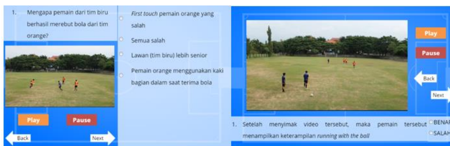
Figure 4. Multiple Choice and True False Evaluation Pages