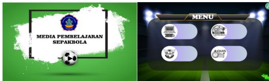
Figure 1. Initial Display and Menu Page

The development stage produces a product that is still in the form of prototype I. The making of this learning media uses the articulate storyline 3 application as a layout and quiz maker application, and Adobe Premiere pro is used as a learning video editing application and case studies on the quiz menu. The learning media developed has several aspects in it, namely textual and audio-visual learning materials, as well as evaluations to test students' understanding of the material provided. The results of this prototype I named D-MENBOLA can be seen from Figure 1 - Figure 4 below.