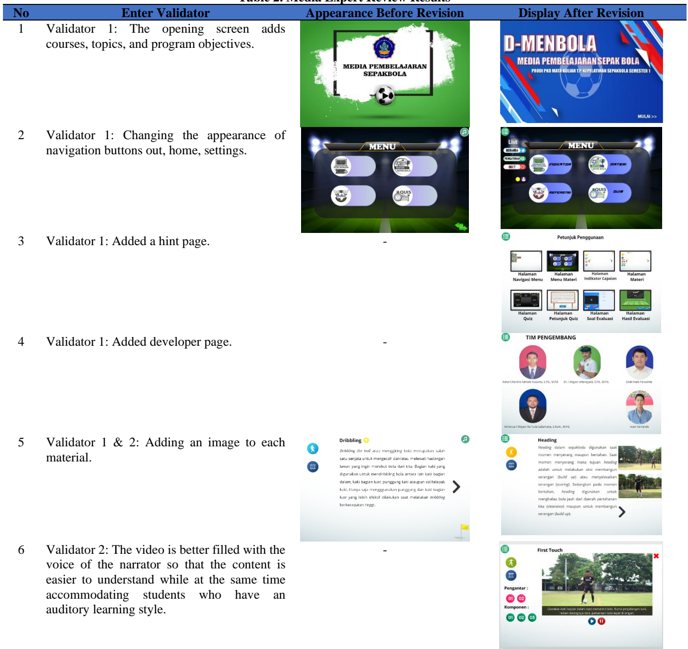
Table 2. Media Expert Review Results

In this evaluation stage, input and review results from media experts are shown in table 2. Input and assessment from validators become a reference for improving this learning media. So that the next stage, namely trials in small groups and field trials/trials in large groups, can be carried out to see the practicality and effectiveness of the developed learning media.