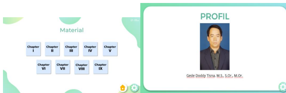
Figure 2. Display of Material Menu and Developer Profile