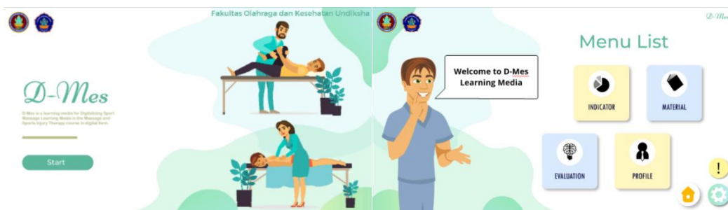
Figure 1. Initial View and Menu Page

The D-MESS, which has been designed but is still in prototype form, is then assessed by three validators consisting of media experts, programming experts, and sports massage experts. The display of the successfully designed D-MESS prototype could be seen in Figures 1-3. Based on Figure 1, you could see the initial display and menu page. In figure 2, the menu material and developer profile are shown. Figure 3 depicts the quiz menu display.