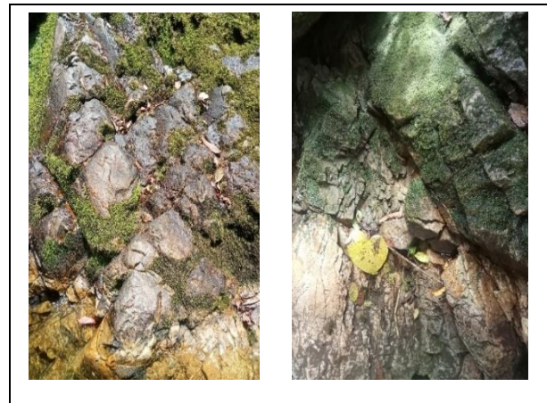
Fig 3. Appearance of the Joints at ST01 (Left) and ST02 (Right)

In areas dominated by intrusive igneous rocks with relatively low weathering rates, TDS values tend to be lower. This occurs because the mineral dissolution process in these rocks is still limited, resulting in relatively few dissolved ions entering the water. Although some rock structures contain fractures and joints that serve as water infiltration pathways, the contribution of dissolved minerals resulting from these processes is still relatively low.