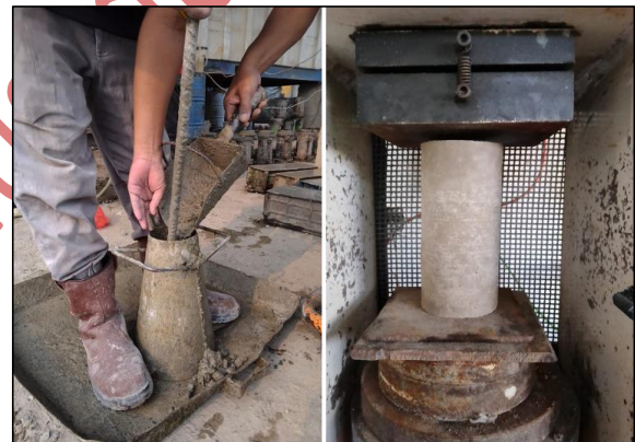
Fig. 1. (A) Slump Test (B) Compressive test

Concrete tests were conducted on the concrete, both in fresh and hardened concrete conditions. As illustrated in Figure 1A, the slump test on fresh concrete was conducted in accordance with ASTM C143 criteria. For the hardened concrete tests, cylindrical specimens with dimensions of 100 mm x 200 mm were prepared and subjected to water immersion curing. The reason for choosing 100 mm x 200 mm specimens is based on the limited capacity of laboratory mixers, ease of handling due to lighter weight, and simpler casting and curing processes. Additionally, using the same batch volume was able to produce more than 150 mm x 300 mm specimens, thus reducing the variability in the test results. These specimens underwent unit weight and compressive strength tests at ages 3, 7, and 28 days. The compressive strength was evaluated using a compression testing machine, following ASTM C39 standard method as shown in Figure 1B.