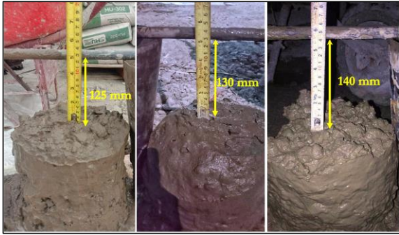
Fig. 2. The slump test results for each mixture

viscosity of concrete at the molecular level compared to superplasticizers, which operate on a larger scale. Additionally, CNT act as nano-fillers that occupy small voids between cement and aggregate particles, leading to a more cohesive and uniform mixture. This nano-scale filling enhances particle flow, contributing to an overall improvement in the concrete structure. Due to their large surface area, CNT can achieve these results with lower dosage requirements, while superplasticizers often necessitate higher doses to attain similar effects. The efficacy of CNT at low doses makes them an efficient choice for enhancing both the workability and overall quality of concrete mixtures.