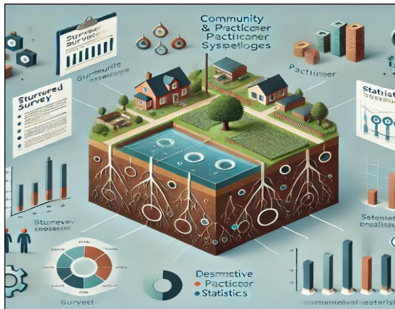
Fig 1. visual illustration illustrating the concept of community-based research

standards set by the globally recognized and indexed journal Scopus.