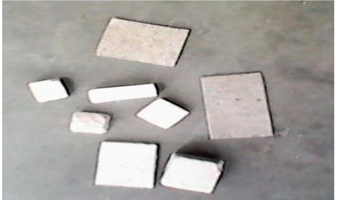
Figure 1: Test samples of the dry porous materials

All the porous materials gathered for this research work were subjected to continuous sun-drying and weighing until no change in mass was observed in each case. This was necessary in order to ensure that the test samples contained no moisture. The materials were then cut into three test samples, each, of regular shape. Also, one sample, being the fourth in each case was shaped for the standard test in order to determine the reference bulk density value. Some of the samples are shown in figure 1 below.